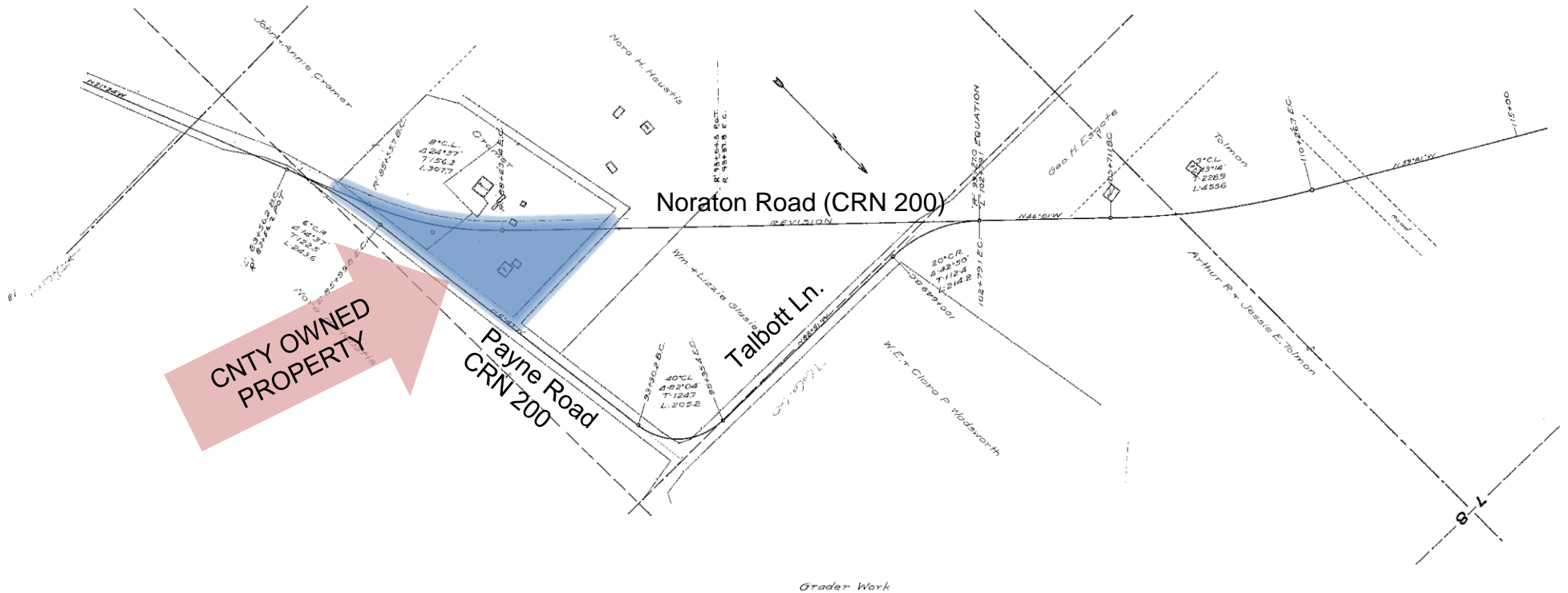
Exhibit B Lancaster North 15-04-08-00-0000